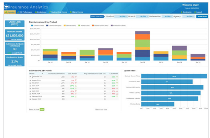
Kofax makes BI accessible to all on a platform that provides the scalability and performance not previously possible.

Insight eliminates the cost and complexity of conventional BI solutions, while delivering advanced functionality for operational performance improvement and data visualization. Insight is the comprehensive platform for all your BI needs.